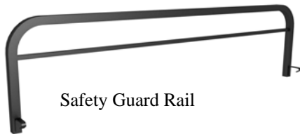
Safety Guard Rail

It is critical to always have the steel bunking pins inserted into each post when lofting the wood ends. It is also critical to be sure that the wood ends are lifted off the bunking pins when disengaging the wood ends as tilting the wood end can damage the wood end if it is still resting over the steel bunking pin. Lifting the wood end up off the bunking pins during any reconfiguration of the loft units will avoid this damage to the wood ends.