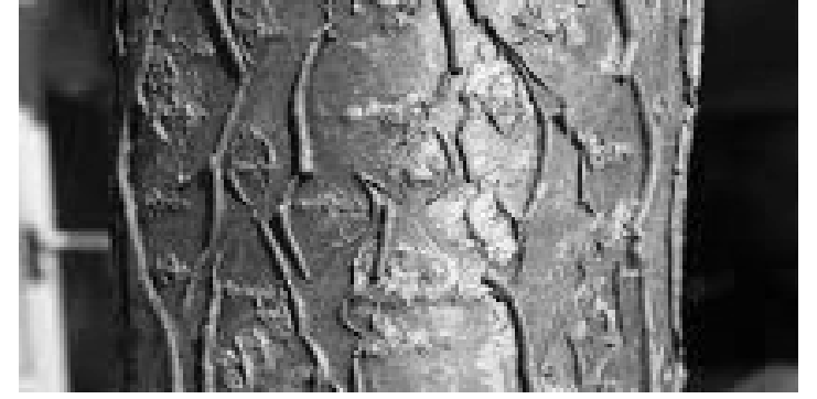
A CLOSE LOOK AT AMUR MAACKIA BARK

So, if you are looking for a small, tough tree with colorful flowers and interesting bark that stands out, this might be the tree for you.