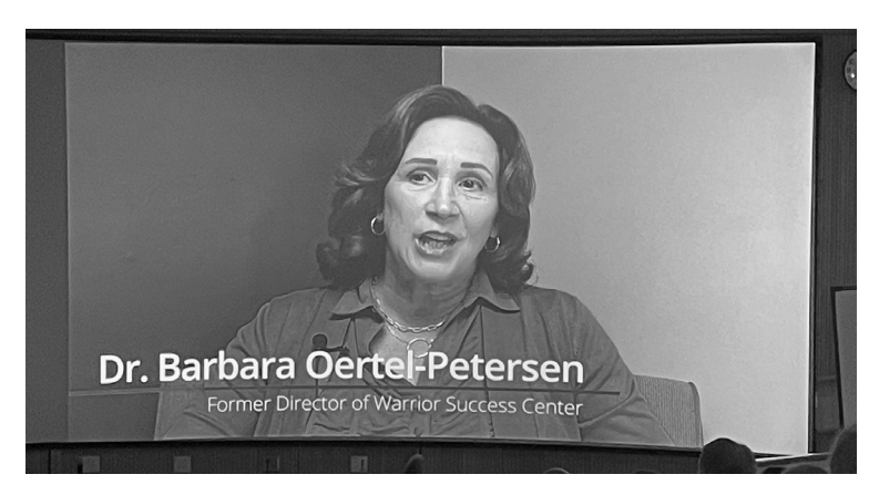
A SHOT FROM BARB'S DOCUMENTARY