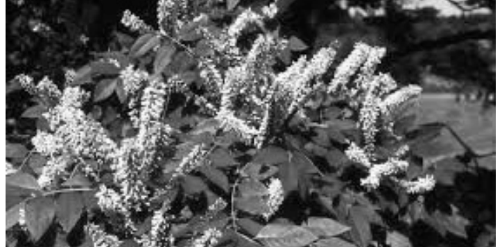
FLOWERS OF THE AMUR MAACKIA