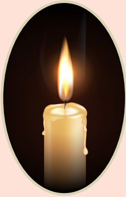
Betty Emmons Spouse of Bill Emmons September 30, 2024