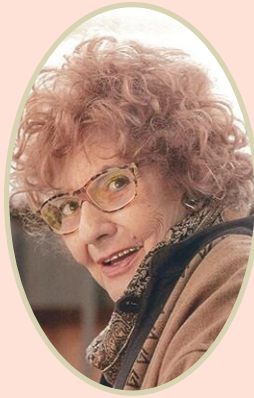
Vivian Fusillo Theatre & Dance August 17, 2024