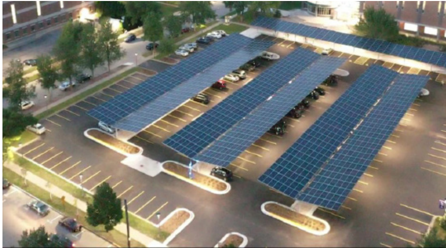
WSU's Solar Carport in the lot at Main and 11th Streets.