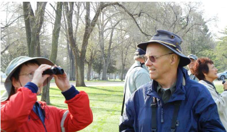
Spring Birding - Spring 2013

Election 2024: Democracy Challenged.....9