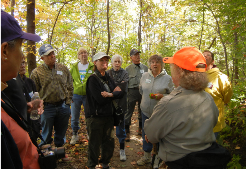
Reading the Woods - Fall 2012